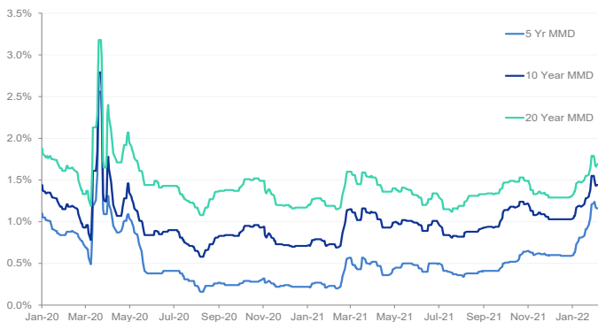
MMD Bond Index January 2020 - Current

Recent weeks have also seen a new trend in the demand for municipal bonds as fund flows have turned negative. After a long stretch of many months of funds flowing into municipal bond mutual funds and ETFs, the last three weeks have seen outflows from municipal bond funds including net outflow of $4.276 billion in the week ended February 2 as reported by The Investment Company Institute (ICI). The chart below illustrates this reversal in fund flows.