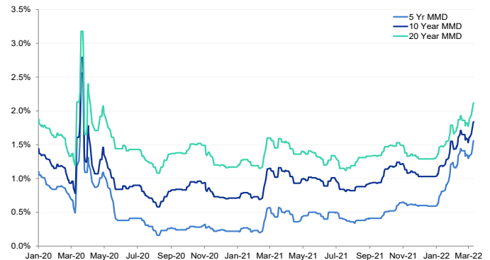
MMD Bond Index January 2020 - Current

Economic Growth: Higher energy and commodity prices due to the Ukraine-Russia conflict are expected to lower economic growth in the U.S. and Europe in 2022, and Europe is expected to be affected more because of its higher reliance on expensive energy imports. On March 8, 2022, S&P Global Ratings trimmed this year's growth estimate for the U.S. and Eurozone by 0.7% and 1.2%, respectively.