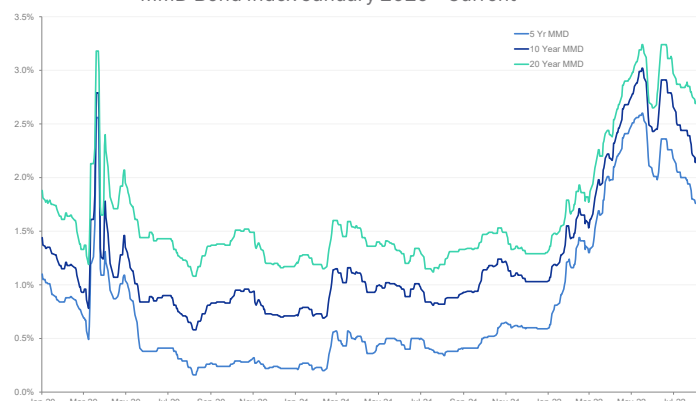
MMD Bond Index January 2020 - Current

The recent downward movement in interest rates is tied to the flow of funds data across the same time frame. While this calendar year has seen negative fund flows in all but three weeks through the end of June, there have been three positive weeks of fund flows over the past four weeks alone, according to the Investment Company Institute (ICI). The most recent data, for the week ending August 3rd, recorded $1.95 billion in positive fund flows, the highest amount in any week year-to-date. Please see the graph below for weekly fund flow data since January 2021.